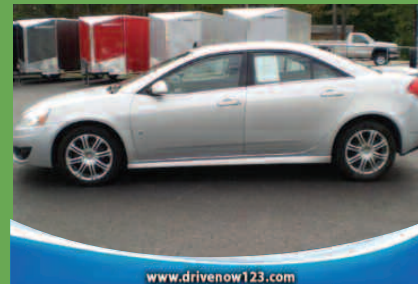
www.drivenow123.com 2009 PONTIAC G6 GT SEDAN V6 motor ONLY $750 DOWN