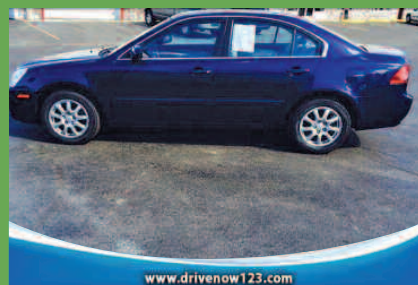
www.drivenow123.com 2006 KIA OPTIMA LX Great fuel economy, room for five ONLY $200 DOWN