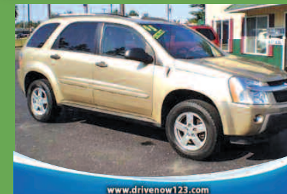
www.drivenow123.com 2005 CHEVROLET EQUINOX LS AWD No Excuses, Like New ONLY $1000 DOWN