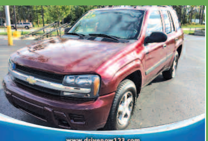
www.drivenow123.com 2005 CHEVROLET TRAILBLAZER LS 4WD A Northern Michigan Favorite ONLY $500 DOWN