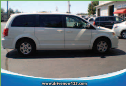
www.drivenow123.com 2011 DODGE GRAND CARAVAN EXPRESS Ready for school, with stow and go NOW ONLY $9,995*