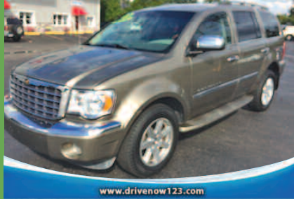
www.drivenow123.com 2007 CHRYSLER ASPEN LIMITED 4WD 3rd row seat, great hauler NOW ONLY $11,395*