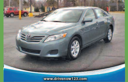
www.drivenow123.com 2011 TOYOTA CAMRY Americas #1 Selling vehicle NOW ONLY $13,995*