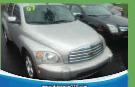
www.drivenow123.com 2007 CHEVROLET HHR LT1 Excellent fuel economy and cargo space ONLY $1000 DOWN