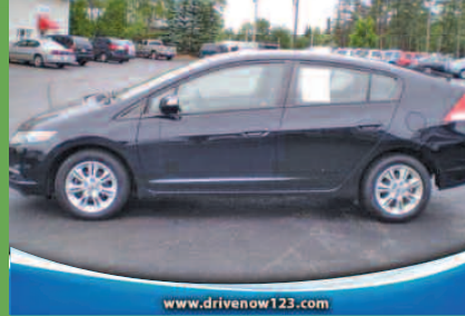
www.drivenow123.com 2010 HONDA INSIGHT EX Well equipped hybrid NOW ONLY $9,595*