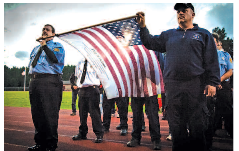
East Jordan had a special 9-11 remembrance presentation during halftime of the East Jordan and Kalkaska football game.

With the loss, the Red Devils slip to 1-2 overall, 0-1 league, will have the week off as their opponent, Rudyard had to forfeit their meeting on September 18 due to not being able to suit up enough players for the contest.