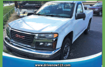
www.drivenow123.com 2007 GMC CANYON Only 49,000 miles ONLY $500 DOWN