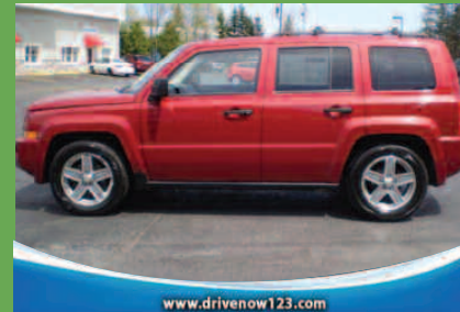
www.drivenow123.com 2007 JEEP PATRIOT SPORT 4WD Fuel Efficient SUV ONLY $1000 DOWN