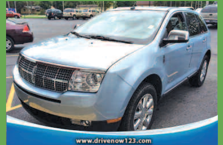
www.drivenow123.com 2008 LINCOLN MKX Luxury SUV Ride NOW ONLY $12,495