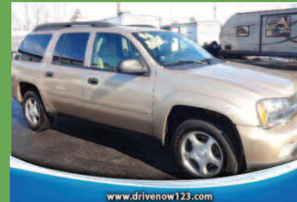
www.drivenow123.com 2006 CHEVY TRAILBLAZER EXT LT 4WD OnStar, Rear Air, Tow Pkg. ONLY $1000 DOWN