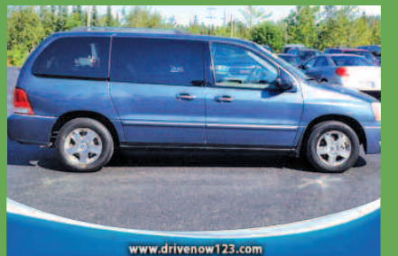
www.drivenow123.com 2006 FORD FREESTAR LIMITED All the bells and whistles ONLY $200 DOWN