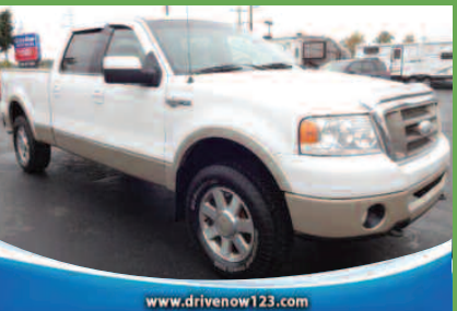
www.drivenow123.com 2007 FORD KING RANCH F150 Top of the Line 4X4 NOW ONLY $18,995*