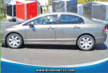
www.drivenow123.com 2008 HONDA CIVIC Great Fuel Economy with low miles NOW ONLY $10,595*