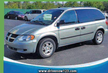
www.drivenow123.com 2006 DODGE CARAVAN SE Great value! ONLY $200 DOWN