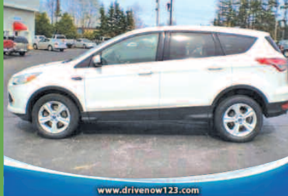
www.drivenow123.com 2013 FORD ESCAPE AWD Like New, Top selling Compact SUV NOW ONLY $14,999*