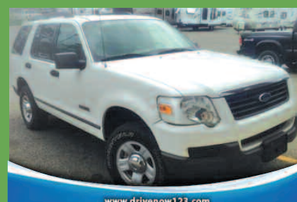
www.drivenow123.com 2006 FORD EXPLORER XLS 4.0L 4WD Popular Mid Size SUV ONLY $1500 DOWN