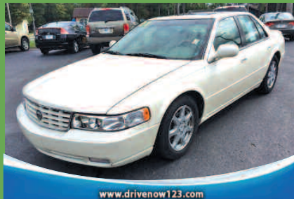
www.drivenow123.com 2001 CADILLAC SEVILLE Take me to Florida ONLY $200 DOWN