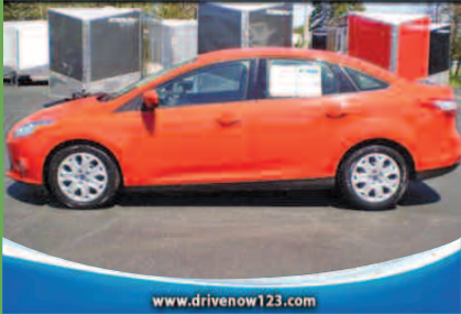
www.drivenow123.com 2012 FORD FOCUS SE SEDAN Air, Cruise, CD Changer NOW ONLY $11,699*