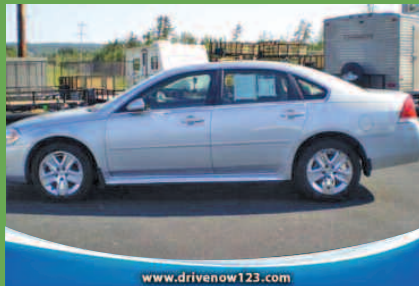
www.drivenow123.com 2011 CHEVROLET IMPALA LS Great Family Sedan NOW ONLY $9,495*