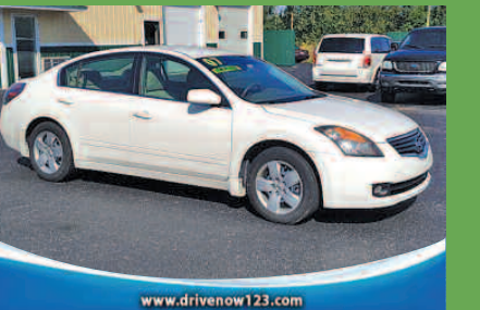
www.drivenow123.com 2007 NISSAN ALTIMA Fuel Efficient, Mid size Sedan NOW ONLY $8,995*