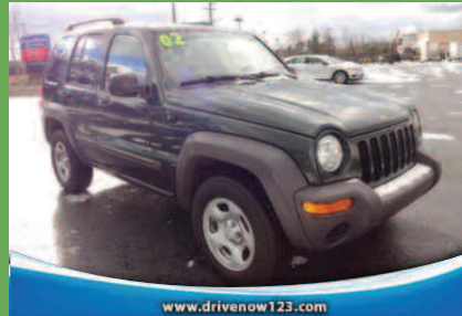
www.drivenow123.com 2002 JEEP LIBERTY SPORT 4WD 2nd Row Folding Seat, Tow Package NOW ONLY $6,099*