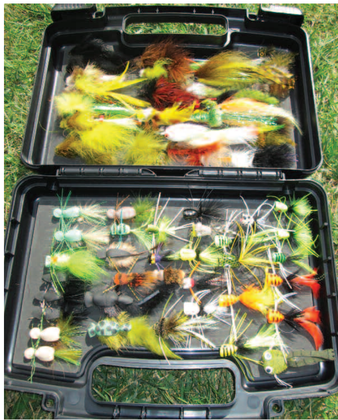
NM Outdoors 9-17-15 Flybox streamers: One of the prize giveaways at the annual Au Sable River clean-up was a colorful box of locally popular streamers and poppers.