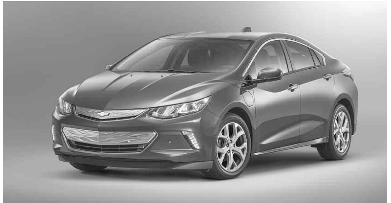
The all-new 2016 Chevrolet Volt electric car with extended range, showcasing a sleeker, sportier design that offers 50 miles of EV range, greater efficiency and stronger acceleration.